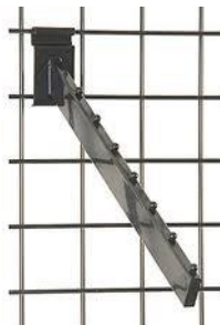
7-BALL WATERFALL HOOK