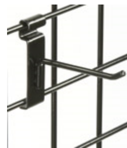
GRID WALL HOOK